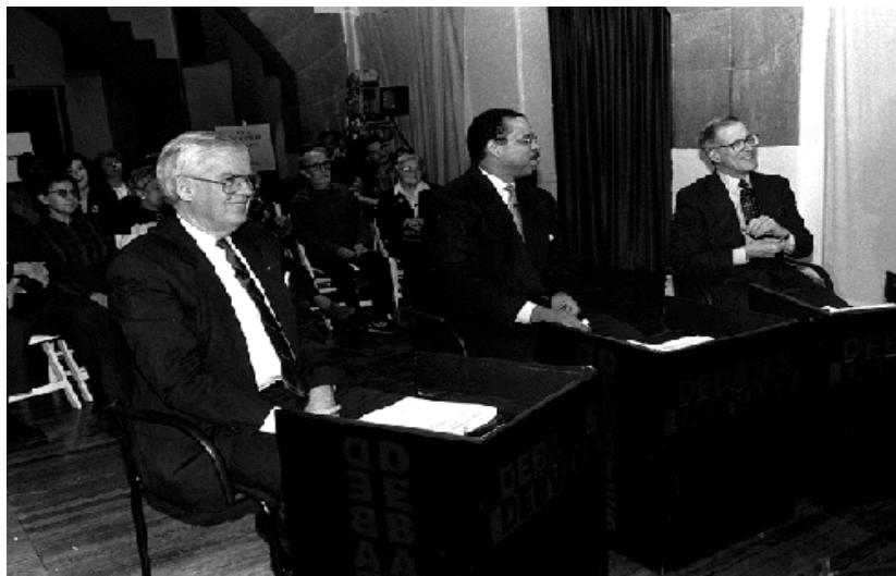
(Left to Right) Chairman of the Cato Institute William A. Niskanen, Ohio State Treasurer J. Kenneth Blackwell, and former Delaware governor Pete Du Pont